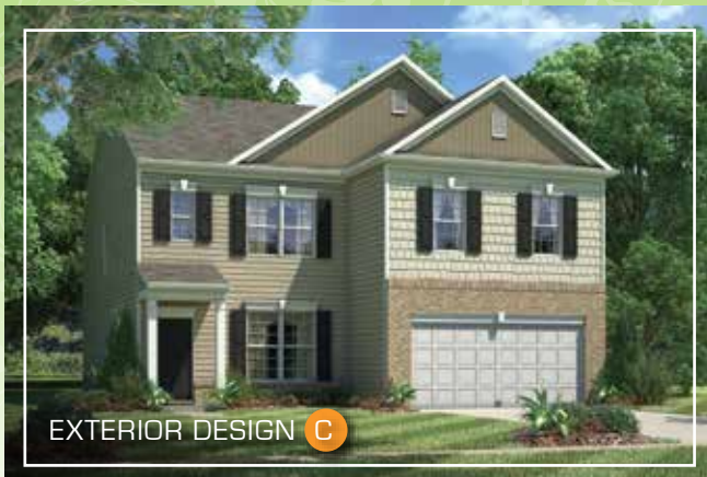
EXTERIOR DESIGN C