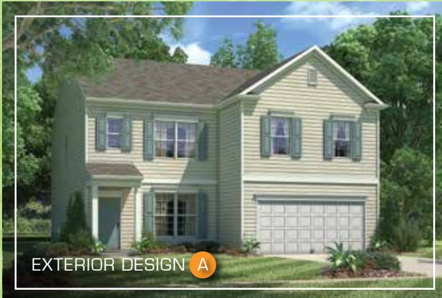
EXTERIOR DESIGN A