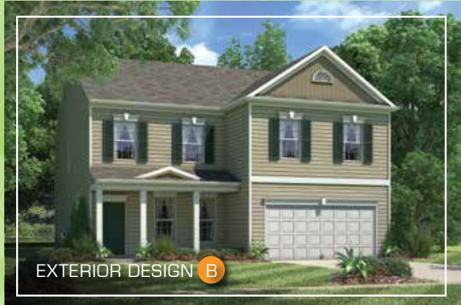
EXTERIOR DESIGN B