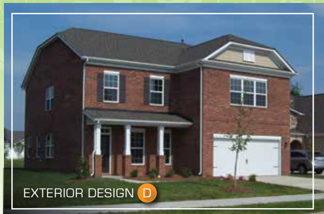
EXTERIOR DESIGN D